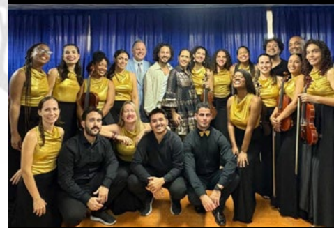
Orquesta de Cámara de La Habana