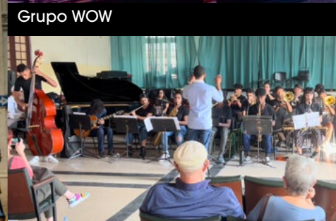
Conservatorio Amadeo Roldán