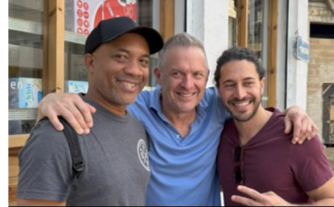
Emmet Cohen Trio

Traditional music and its evolution over the centuries is at the heart of the Cuban soul and mystique. The history of Cuban music is the story of its people—from slavery, political upheaval, revolt and a joyful celebration of Cuban cultural life.