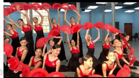
Ballet Lizt Alfonso