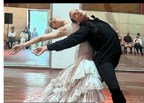
Ballet Español de Cuba