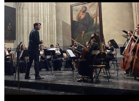
Orquesta de Cámara de La Habana