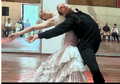
Ballet Español de Cuba