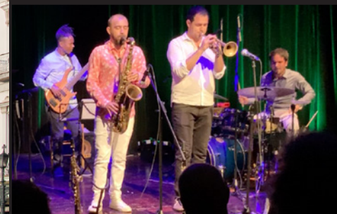
Grupo Harold López-Nussa