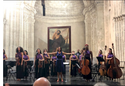
Orquesta de Cámara de La Habana