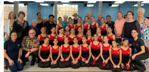
Ballet Lizt Alfonso

Some of the most exquisite historic buildings in the Caribbean are in Cuba. Havana celebrated its 500th anniversary in 2019. Despite 60 years of embargo, Cuba has managed to preserve and restore some of its most important heritage structures, neighborhoods and monuments. Using tourist dollars and financial incentives, much of Old Havana, a UNESCO World Heritage Site, is gradually being rehabilitated to its former beauty. Our patrons will gain an insight into what it takes to gradually restore one of the New World's great cities, one building at a time.