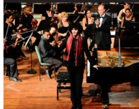
Orquesta Sinfónica Nacional