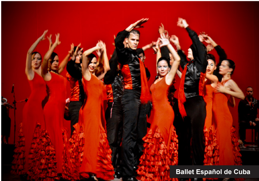
Ballet Español de Cuba