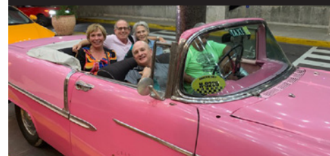
Out for a night on the town