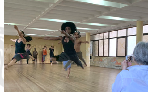
Danza Contemporánea de Cuba

Traditional music and its evolution over the centuries is at the heart of the Cuban soul and mystique. The history of Cuban music is the story of its people—from slavery, political upheaval, revolt and a joyful celebration of Cuban cultural life.