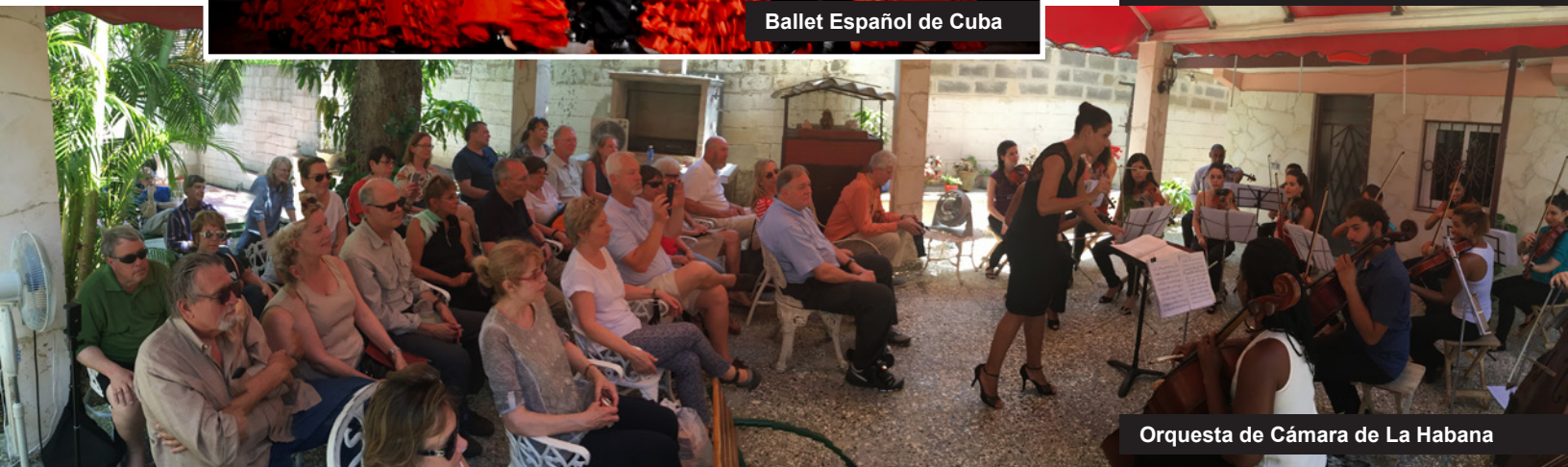
Orquesta de Cámara de La Habana