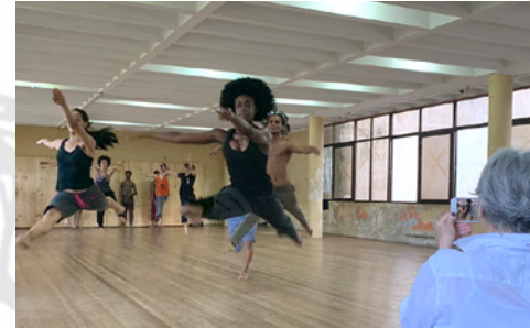
Danza Contemporánea de Cuba