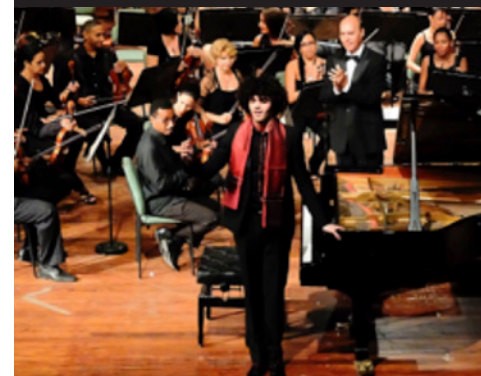
Orquesta Sinfónica Nacional