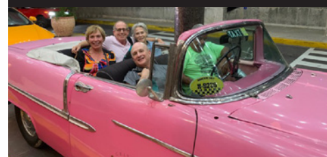
Out for a night on the town