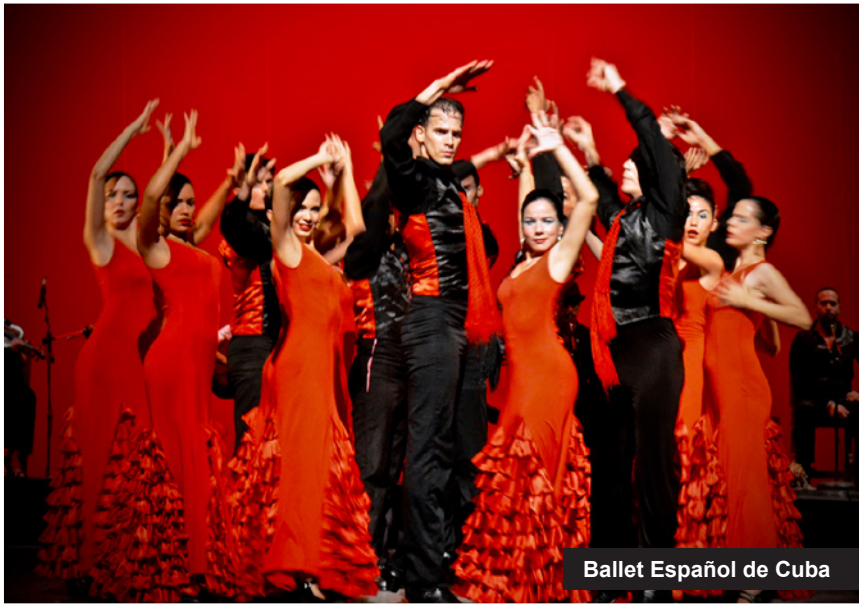
Ballet Español de Cuba

Traditional music and its evolution over the centuries is at the heart of the Cuban soul and mystique. The history of Cuban music is the story of its people—from slavery, political upheaval, revolt and a joyful celebration of Cuban cultural life.