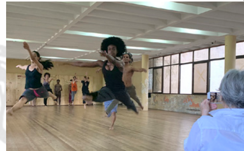
Danza Contemporánea de Cuba

Traditional music and its evolution over the centuries is at the heart of the Cuban soul and mystique. The history of Cuban music is the story of its people—from slavery, political upheaval, revolt and a joyful celebration of Cuban cultural life.