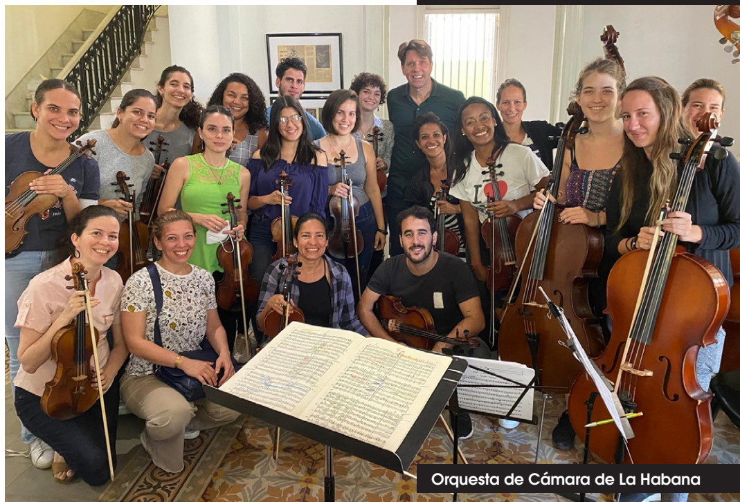
Orquesta de Cámara de La Habana