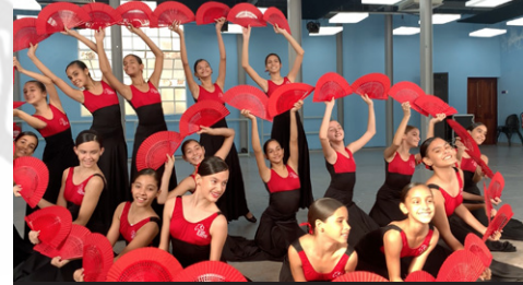
Ballet Lizt Alfonso