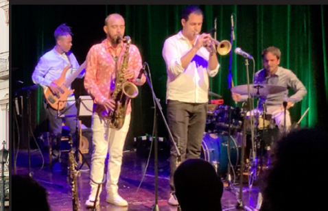
Grupo Harold López-Nussa