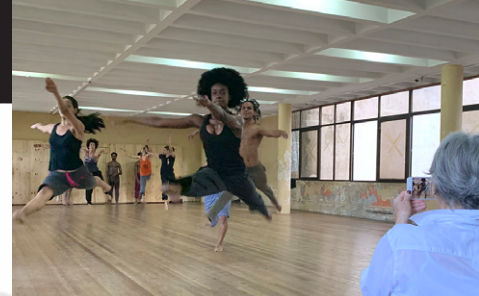
Danza Contemporánea de Cuba

Traditional music and its evolution over the centuries is at the heart of the Cuban soul and mystique. The history of Cuban music is the story of its people—from slavery, political upheaval, revolt and a joyful celebration of Cuban cultural life.