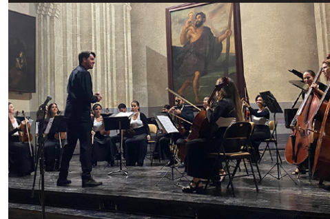
Orquesta de Cámara de La Habana