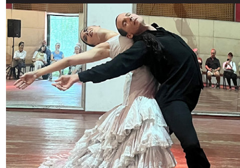
Ballet Español de Cuba