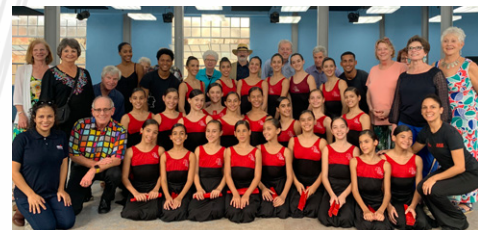
Ballet Lizt Alfonso

Some of the most exquisite historic buildings in the Caribbean are in Cuba. Havana celebrated its 500th anniversary in 2019. Despite 60 years of embargo, Cuba has managed to preserve and restore some of its most important heritage structures, neighborhoods and monuments. Using tourist dollars and financial incentives, much of Old Havana, a UNESCO World Heritage Site, is gradually being rehabilitated to its former beauty. Our patrons will gain an insight into what it takes to gradually restore one of the New World's great cities, one building at a time.