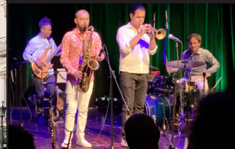
Grupo Harold López-Nussa