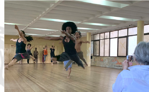
Danza Contemporánea de Cuba