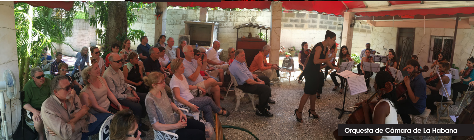
Orquesta de Cámara de La Habana