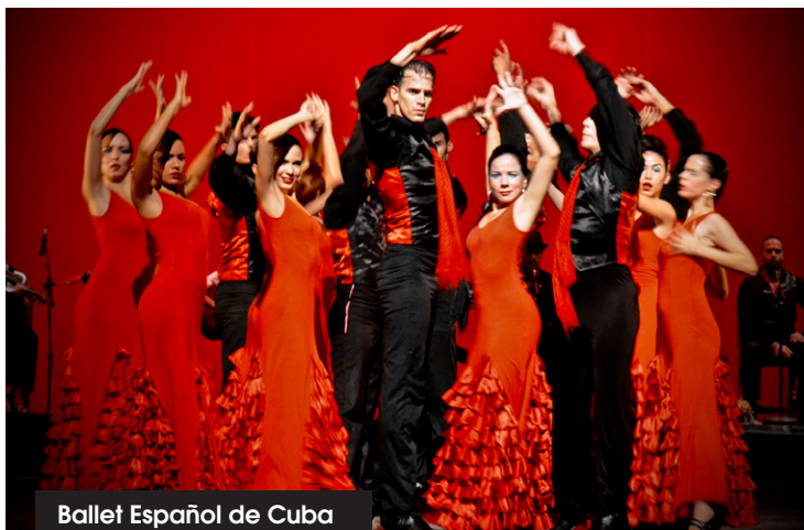
Ballet Español de Cuba