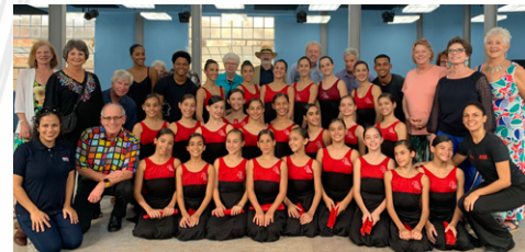
Ballet Lizt Alfonso

Some of the most exquisite historic buildings in the Caribbean are in Cuba. Havana celebrated its 500th anniversary in 2019. Despite 60 years of embargo, Cuba has managed to preserve and restore some of its most important heritage structures, neighborhoods and monuments. Using tourist dollars and financial incentives, much of Old Havana, a UNESCO World Heritage Site, is gradually being rehabilitated to its former beauty. Our patrons will gain an insight into what it takes to gradually restore one of the New World's great cities, one building at a time.