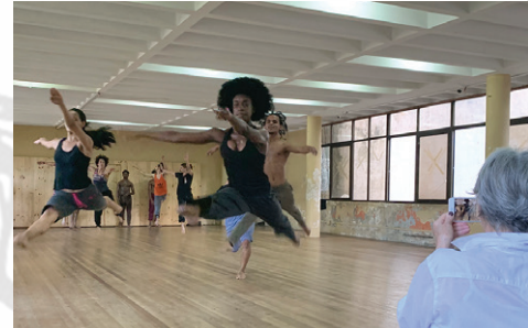
Danza Contemporánea de Cuba

Traditional music and its evolution over the centuries is at the heart of the Cuban soul and mystique. The history of Cuban music is the story of its people—from slavery, political upheaval, revolt and a joyful celebration of Cuban cultural life.