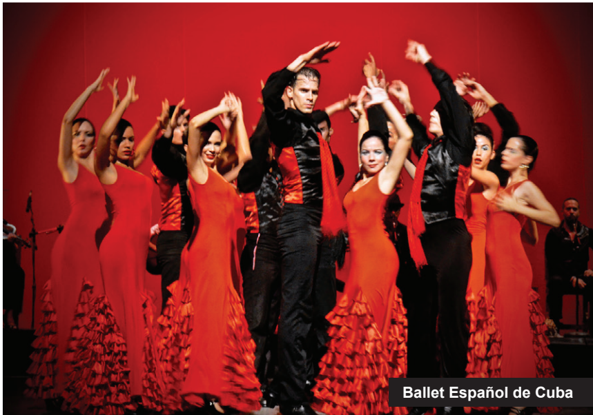
Ballet Español de Cuba