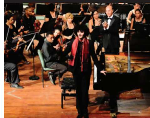
Orquesta Sinfónica Nacional