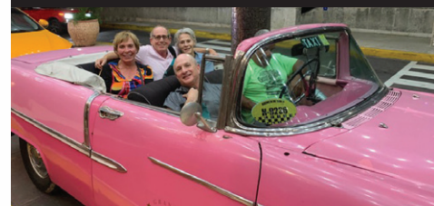
Out for a night on the town