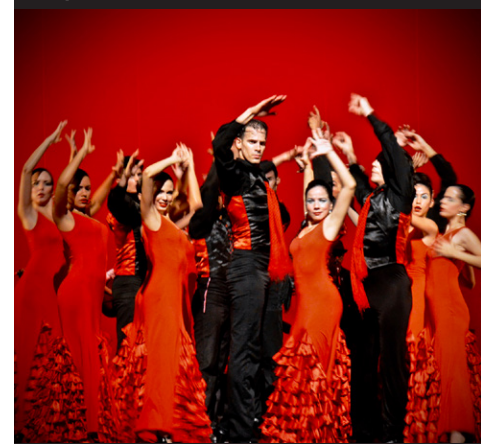
Ballet Español de Cuba