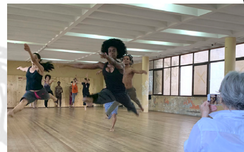
Danza Contemporánea de Cuba