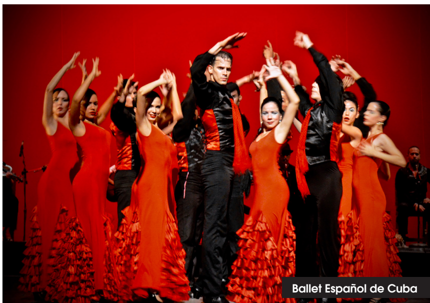
Ballet Español de Cuba