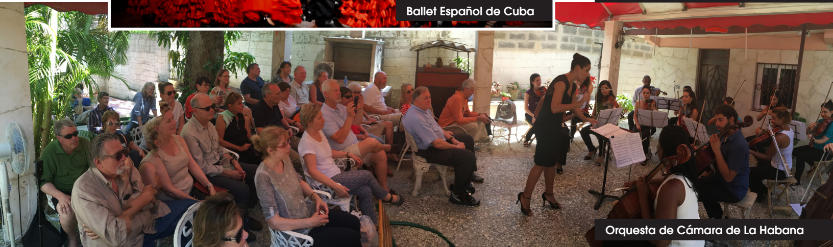
Orquesta de Cámara de La Habana