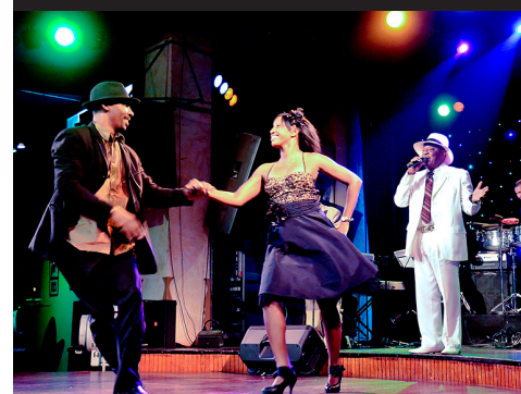
Buena Vista Social Club