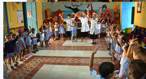
Sisters of the Love of God