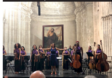
Orquesta de Cámara de La Habana