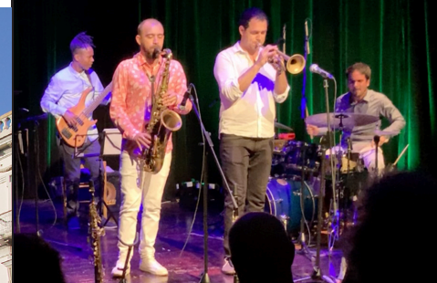
Grupo Harold López-Nussa