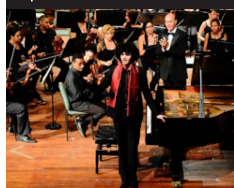
Orquesta Sinfónica Nacional