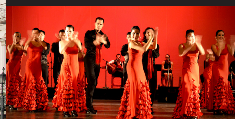
Ballet Español de Cuba