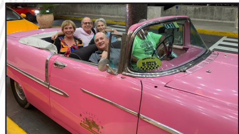
Out for a night on the town

Some of the most exquisite historic buildings in the Caribbean are in Cuba. Havana is celebrating its 500th anniversary. But, despite 58 years of embargo, Cuba has managed to preserve and restore some of its most important heritage structures, neighborhoods and monuments. Using tourist dollars and financial incentives, much of Old Havana, a UNESCO World Heritage Site, is gradually being rehabilitated to its former beauty as the city celebrates five centuries of life. A noted Cuban architect or urban planner will provide our patrons with an insight into what it takes to gradually restore one of the world's great cities, one building at a time.