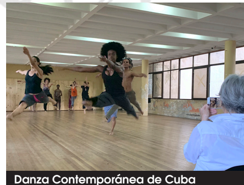
Danza Contemporánea de Cuba

Traditional music and its evolution over the centuries is at the heart of the Cuban soul and mystique. The history of music in Cuba is the story of its people; from slavery, political upheaval, revolt and a joyful celebration of Cuban cultural life.