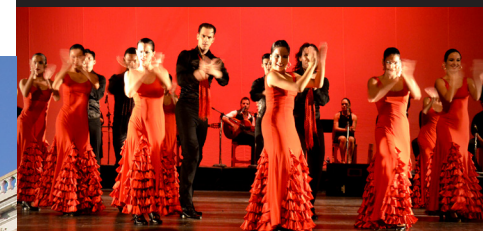
Ballet Español de Cuba