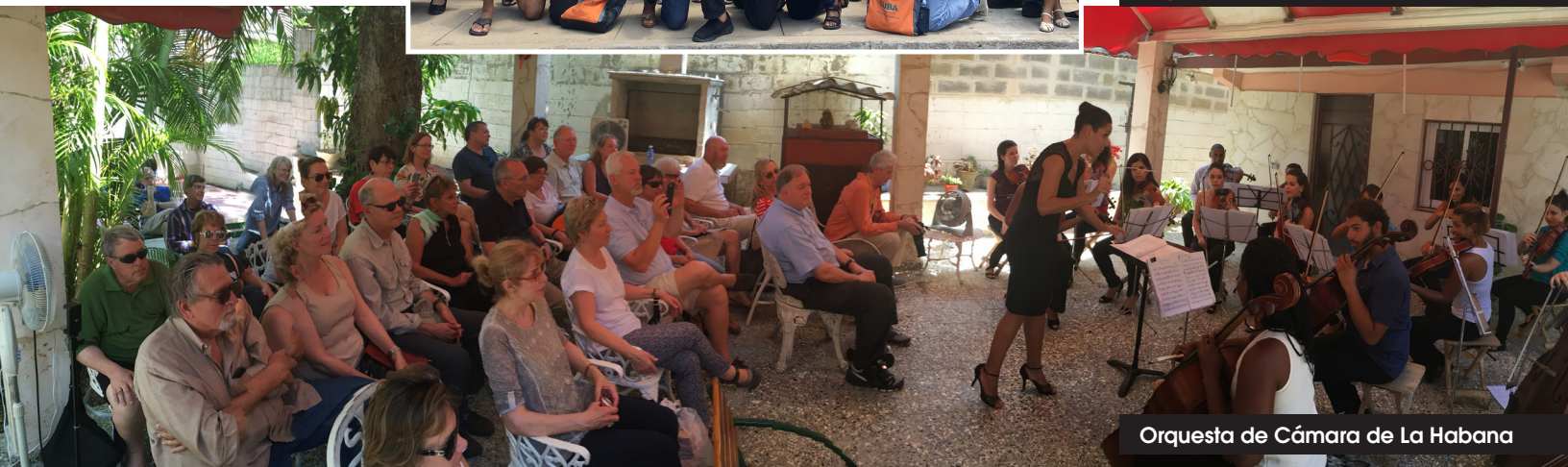
Orquesta de Cámara de La Habana