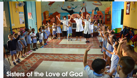
Sisters of the Love of God