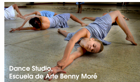
Dance Studio, Escuela de Arte Benny Moré

Some of the most exquisite historic buildings in the Caribbean are in Cuba. Despite the 58 years of embargo, Cuba has managed to preserve and restore some of its most important heritage structures, neighborhoods and monuments. Using tourist dollars and financial incentives, much of Old Havana, a UNESCO World Heritage Site, is gradually being rehabilitated to its former beauty as the city gears up to celebrate five centuries of life. A noted Cuban architect or urban planner will provide our patrons with an insight into what it takes to gradually restore one of the world's great cities, one building at a time.