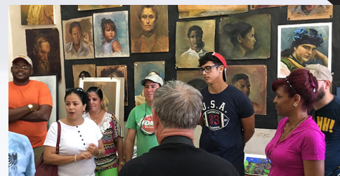
Art Studio, Escuela de Arte Benny Moré