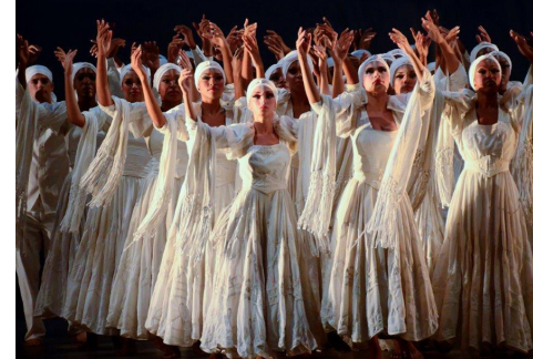
Conjunto Folklórico Nacional de Cuba