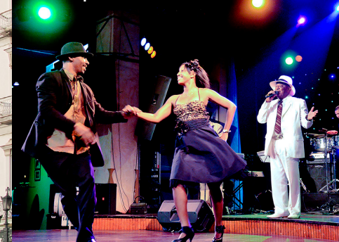
Buena Vista Social Club